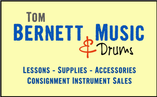
TOM BERNETT MUSIC & DRUMS October 15, 2012

You must be logged in to post a comment.